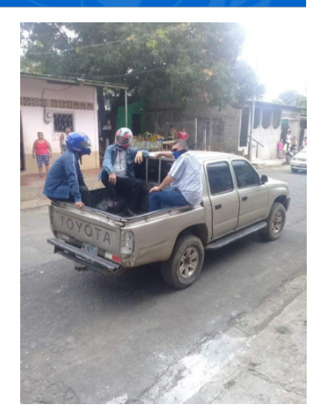
Pro-Government elements outside the house of a student leader in León, 14 September 2019

Governmental sources indicated that more than 70 individuals were deprived of their liberty<sup>35</sup>. Most of these arrests occurred without an arrest warrant or being caught in flagrante delicto and people were released after few hours without charges. Individuals who had participated in the 2018 demonstrations, including some of those who left Nicaragua and recently decided to return from exile, were also arrested for short time periods.