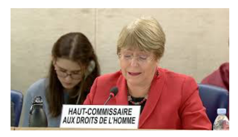
The United Nations High Commissioner for Human Rights presented a report on the situation in Nicaragua during the 42nd session of the Human Rights Council. 10 September 2019

Introduction This bulletin covers a two-month period between 1 August and 30 September 2019. Throughout this period, the enjoyment of the rights to freedom of expression and peaceful assembly continued to be unduly restricted. Individuals who were deprived of their liberty in the context of the 2018 protests and then released under the Amnesty Law, were often subjected to harassment and persecution, especially those with a leading role. On some occasions, these acts of harassment were also directed against their defense lawyers.