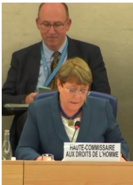
The UN High Commissioner for Human Rights presented an oral update on Nicaragua before the Human Rights Council. Geneva, 27 February 2020.

Introduction This bulletin covers the period from 1 February to 31 March 2020 and briefly analyzes main patterns of human rights violations that continued to be monitored in Nicaragua. Issued two years after the eruption of massive demonstrations and the ensuing socio-political crisis in Nicaragua, this bulletin also includes an annex that provides information on the implementation status of the recommendations formulated in the OHCHR report published on 29 August 2018 and in the United Nations High Commissioner for Human Rights' report presented to the Human Rights Council (HRC) on 10 September 2019.