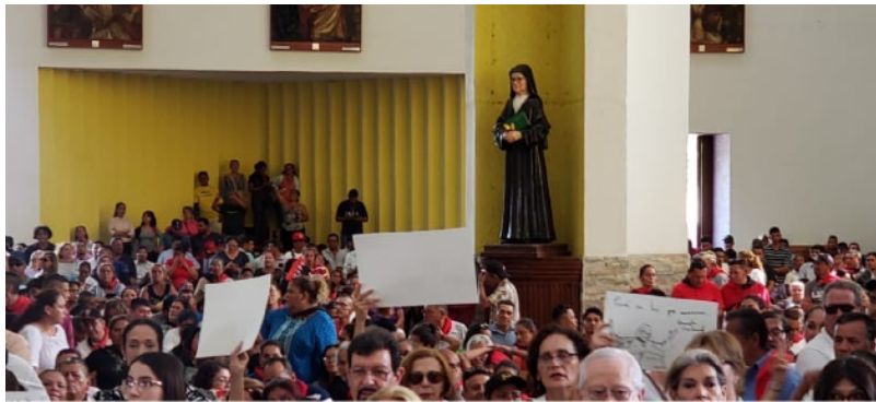
Pro-Government elements disrupted the memorial service of the poet and Catholic priest, Ernesto Cardenal. Managua 3 March 2020.

On 14 March, the Polytechnic University of Nicaragua (UPOLI by its Spanish acronym) suspended a feminist and student leader, who is also member of the Civic Alliance, in order “to protect the life of students, professors and administrative workers” . The decision followed the protests against her presence in the campus organized by members of students and youth organizations, who support the Government.