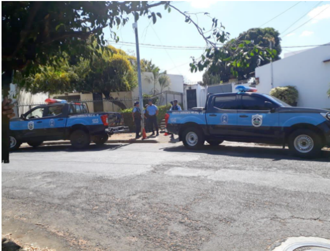
Police deployment outside the house of a member of the opposition. Managua, 25 February 2020.

2018 protests, were arrested on 6 and 28 February, and charged with aggravated robbery and drug trafficking, respectively. OHCHR collected information that seems to indicate, prima facie , that both cases amount to arbitrary detentions and were politically motivated.