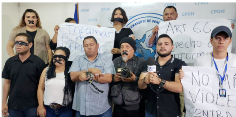
Journalists held a press conference to report violations of the right to freedom of expression. Managua 4 March 2020.

Before the suspension of the 43 rd session of the HRC on 13 March, due to the COVID-19 outbreak, eight UN Member States tabled a draft resolution on the human rights situation in Nicaragua to be considered by the Council. The above-mentioned draft resolution will be considered for adoption when the Council resumes its 43 rd session.